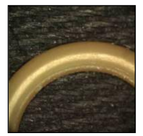
Kalrez® 9100 Top Nozzle Seal