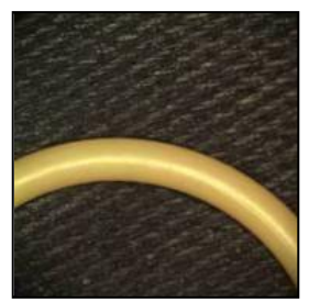
Kalrez® 9100 Poppet Seal

Figure 2. DuPont<sup>™</sup> Kalrez<sup>®</sup> 9100 and incumbent seals after processing 5000 wafers. It was the research center's opinion that the Kalrez<sup>®</sup> 9100 seals could have continued to function beyond the scheduled PM cycle of 5,000 wafers.